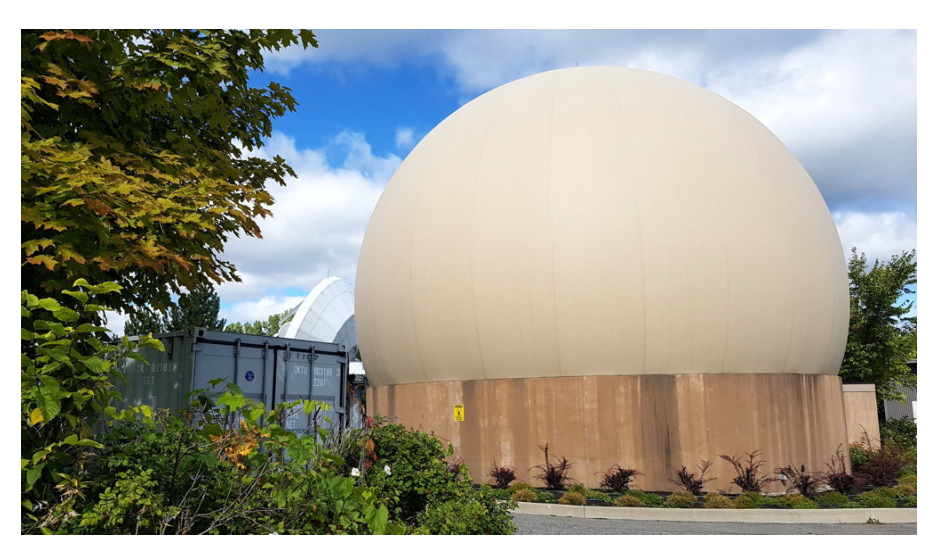
This radome at SSi Canada's offices in Kanata, Ont., encloses one of the satellite dishes the company uses to run its Qiniq and SSi Mobile networks.

"Without immediate support we will be forced to take truly unwanted actions"