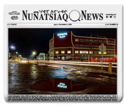
CLICK HERE FOR E-EDITION >