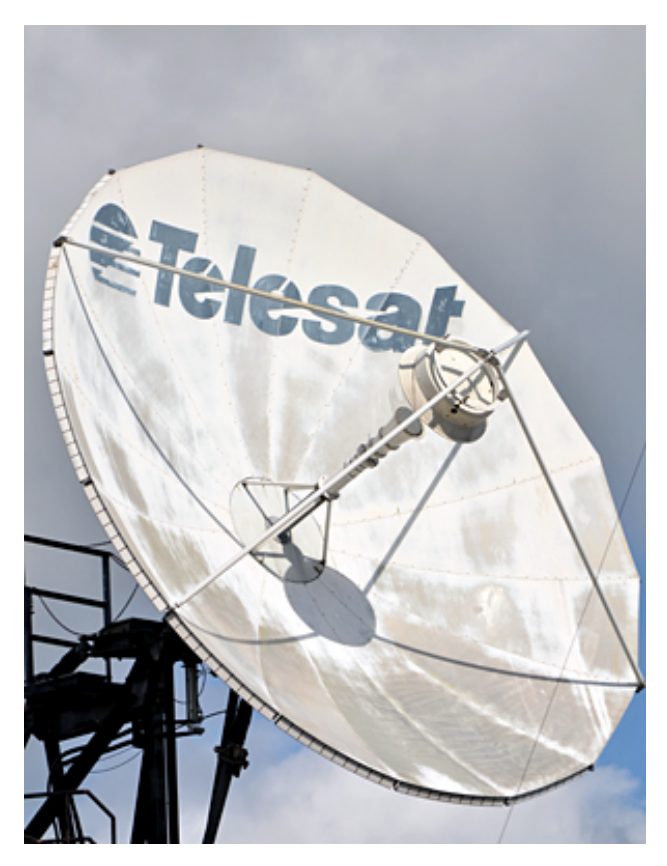
Satellite company Telesat is currently being investigated by the Canadian Radio-television and Telecommunications Commission for its prices to Nunavut and other communities in the north.

All of Nunavut's residents and businesses are entirely dependent on fixed satellite services to receive Internet services